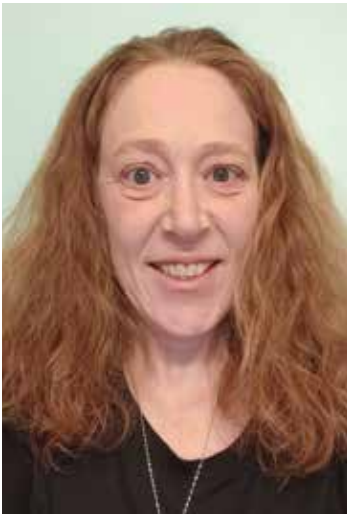
Meredith Patton Southern Elementary School