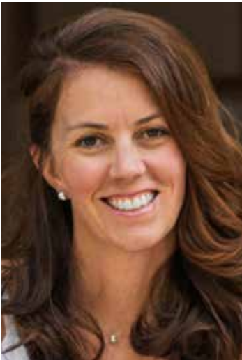
Elizabeth Beimesche Moyer Elementary School